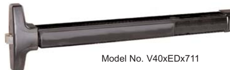
Model No. V40xEDx711