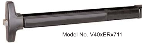
Model No. V40xERx711