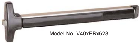
Model No. V40xERx628

The Electric Latch Retraction (ER) exit device option is designed for entrance and exit doors with panic or fire exit hardware where remote unlocking, remote dogging, access control or automatic door operator is desired.